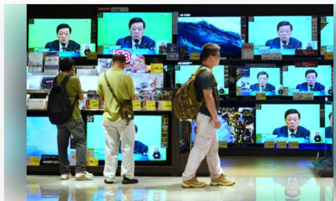
SAR proposes new funding initiatives, institutional restructuring for I&T growth