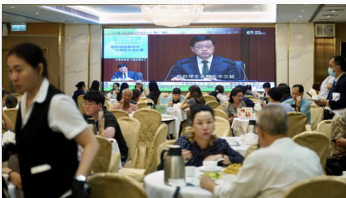
HK floats idea of scholarships, incentives for high-caliber talent